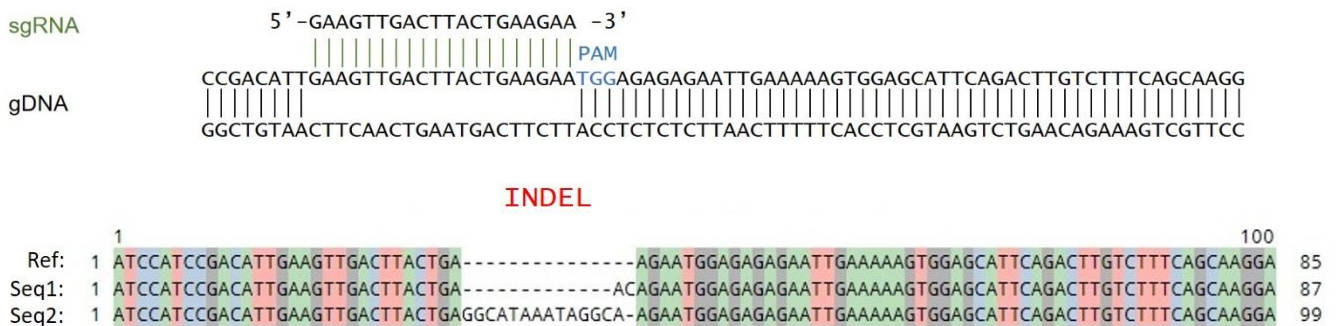
Figure 1: Genomic Sequencing of B2M in the B2M Knockout NFAT Luciferase Reporter Jurkat Cell Line. Genomic DNA from the B2M Knockout NFAT Luciferase Reporter Jurkat cells were isolated and sequenced. The PAM (Protospacer Adjacent Motif) is shown in blue, the sgRNA (synthetic guide RNA) and the Indels (Insertions/Deletions) in the two TRAC alleles are labeled, B2M genomic DNA labeled as Ref.