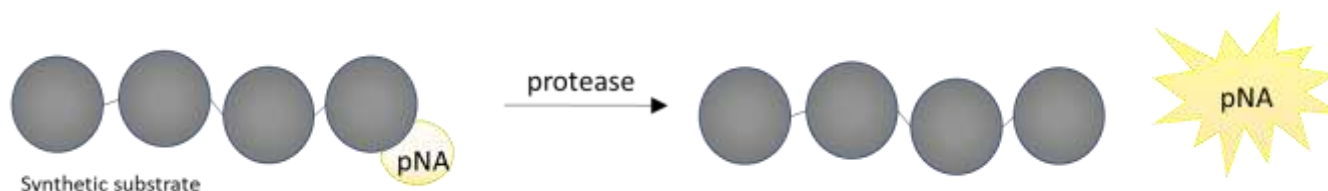
Figure 1: Illustration of the assay principle.

To determine the effect of an inhibitor on thrombin activity, the enzyme should be preincubated with or without the test inhibitor prior to adding the chromogenic substrate to the reaction. The assay was functionally validated using Dabigatran, a potent inhibitor of Thrombin.