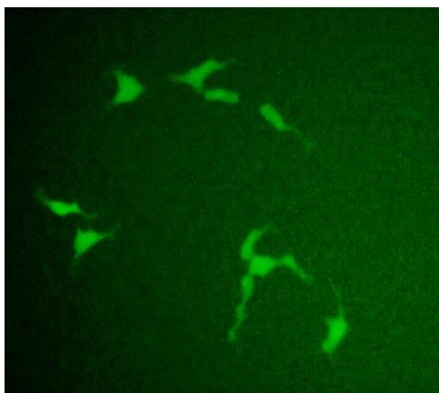
Figure 2. Transduction of HEK293 cells using AAV5 ZsGreen.

1 \times 10^5 cells/well were transduced in a 6-well plate with AAV5 ZsGreen at an MOI of 1 \times 10^4 . After 72 hours of transduction, ZsGreen expression in the target cells was observed under a fluorescence microscope. ZsGreen expression was stable over time and still observed 30 days after transduction.